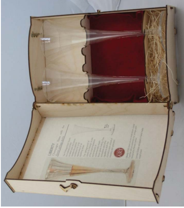
Liberty encased in a Clearly Art exclusive gift chest COFFLU

The 'Pérlage Point' is the pointy bottom of the flute that forces the bubbles to their smallest size and hence creates the optimal conditions for a full appreciation of all sparkling wines. The 'pérlage point' of Liberty & Asburgo is one of the most impressive achievements of contemporary mouth-blown glass making. Few companies are today capable to work the crystal to such a level of mastery and precision.